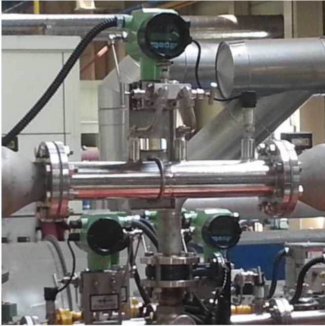
FN mass flow meter installed at Korea Institute of Machinery and Materials

The amount of energy is calculated by measuring the flow rate of biogas as a mass flow rate, and the amount of biogas in a sewage treatment plant can be measured with the FN mass flow meter that replaces the inaccuracy of the existing thermal mass flow meter.