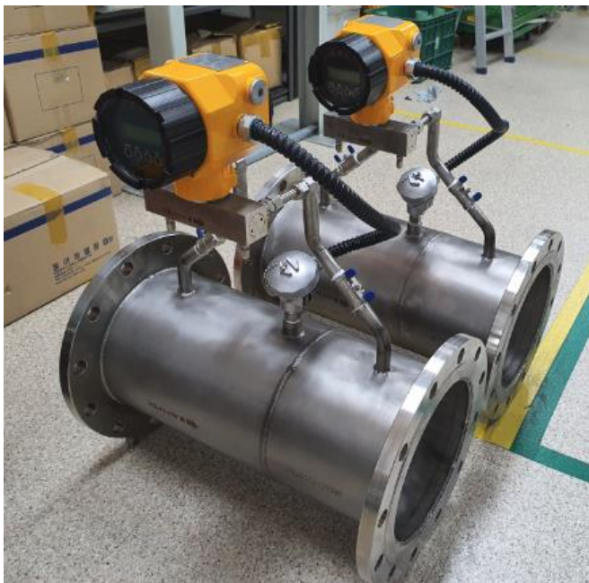
FN mass flow meter for biogas delivered to a domestic sewage treatment plant

The amount of energy is calculated by measuring the flow rate of biogas as a mass flow rate, and the amount of biogas in a sewage treatment plant can be measured with the FN mass flow meter that replaces the inaccuracy of the existing thermal mass flow meter.