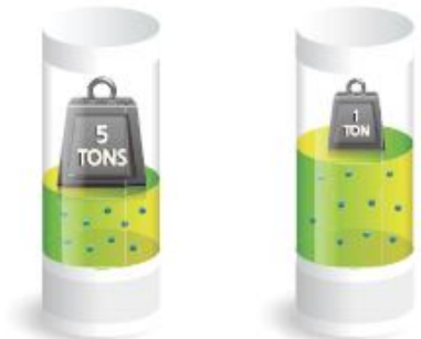
Change in volume (volume) for the same mass due to temperature and pressure changes

In the liquid state, a change in temperature causes a change in volume rather than an effect of pressure. For hydrocarbons or refrigerants, this effect is noticeable. When refueling with gasoline or diesel, it will be more economical than hot hours in the middle of the day when the temperature is cold. For diesel, the volume difference between summer and winter is about 4%