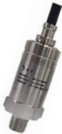
Double Membrane KC-8300 Series